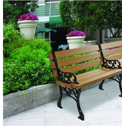
Shown for cedar color only