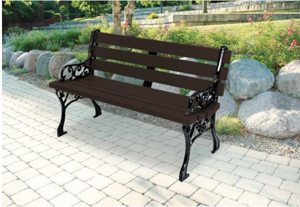
Size of Bench, color will be cedar

Benches are a permanent and lasting way to memorialize a loved one. They offer a place of quiet reflection for many years.