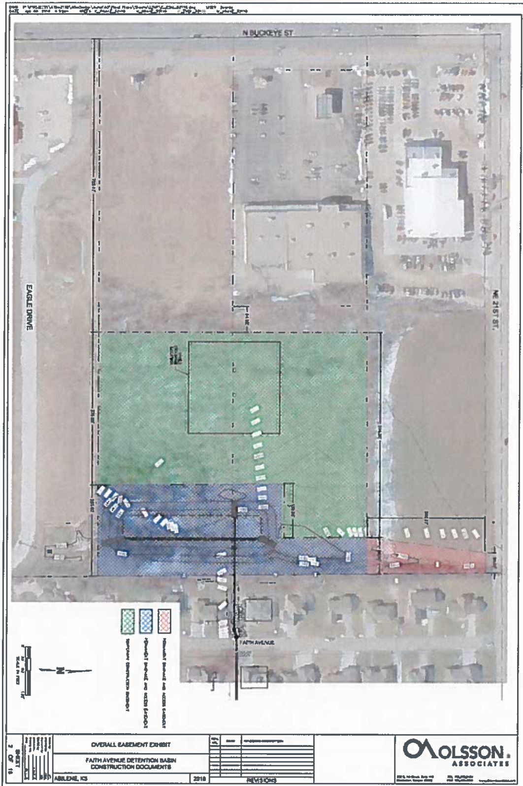
EXHIBIT A Description of Property